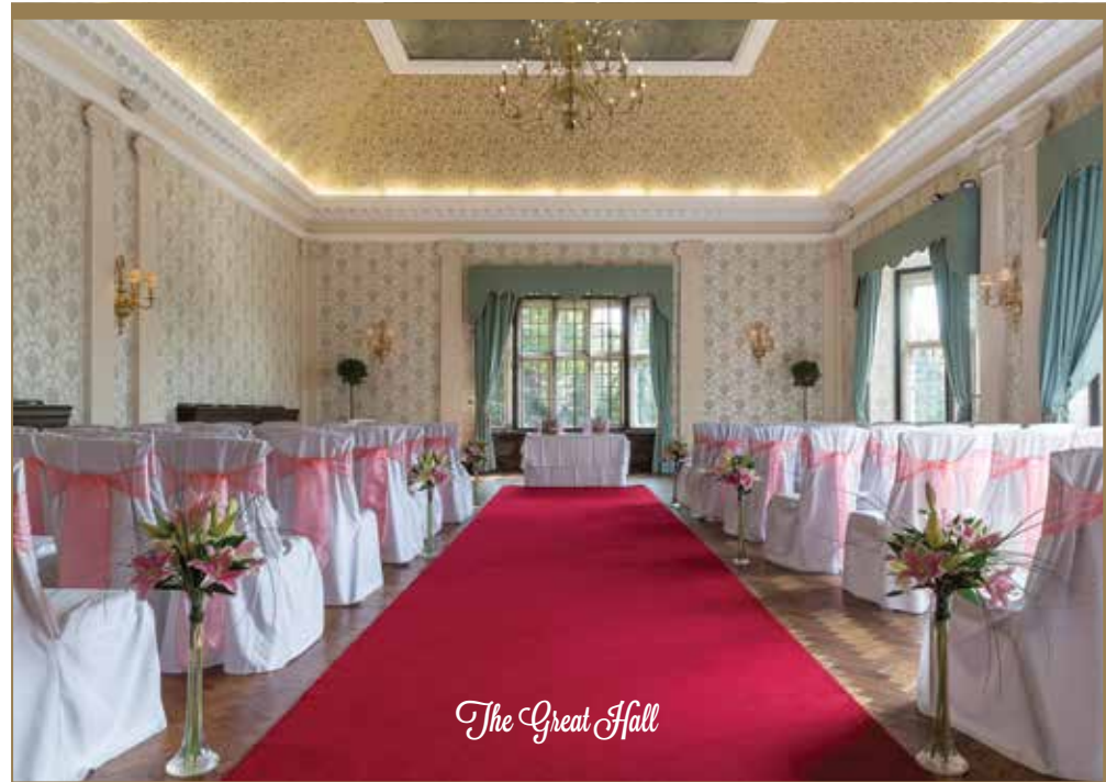
The Great Hall