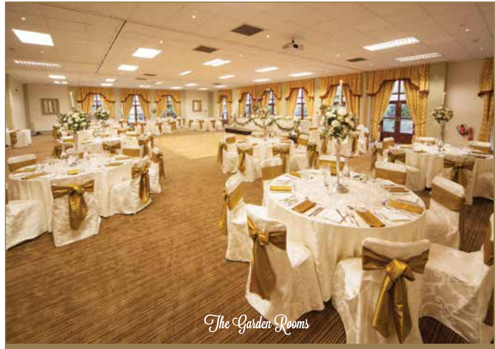
The Garden Rooms