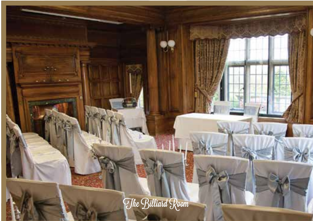
The Billiard Room