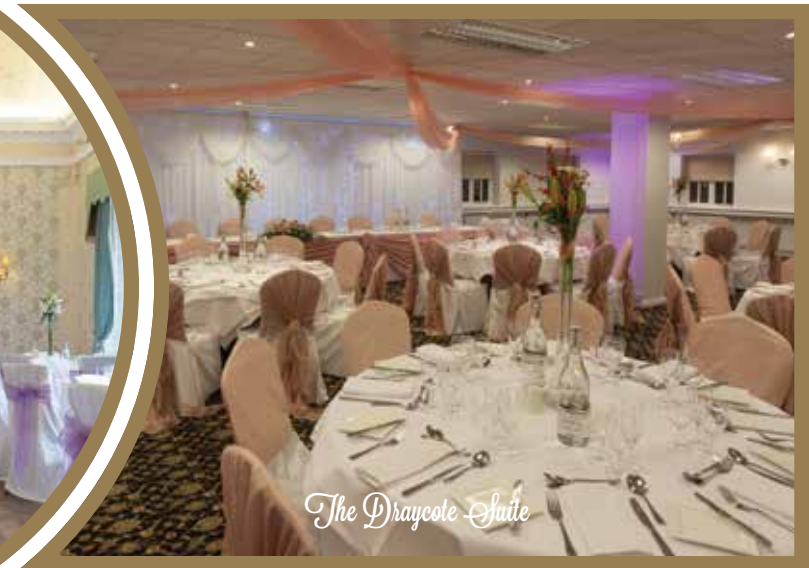
The Draycote Suite