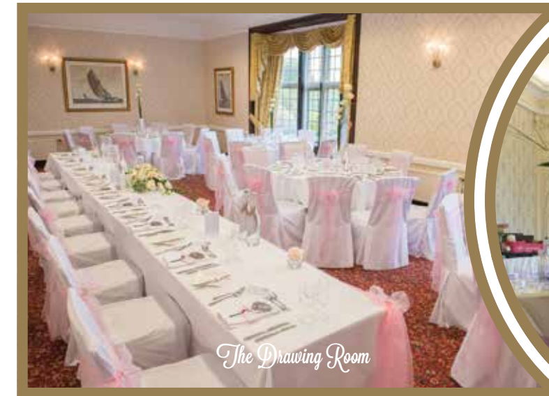
The Drawing Room

Wedding Breakfast – minimum 50 adults / maximum 100 Evening Reception – minimum 50 adults / maximum 150 Civil Ceremony – maximum 300