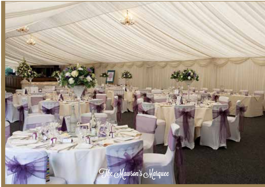
The Mawson's Marquee