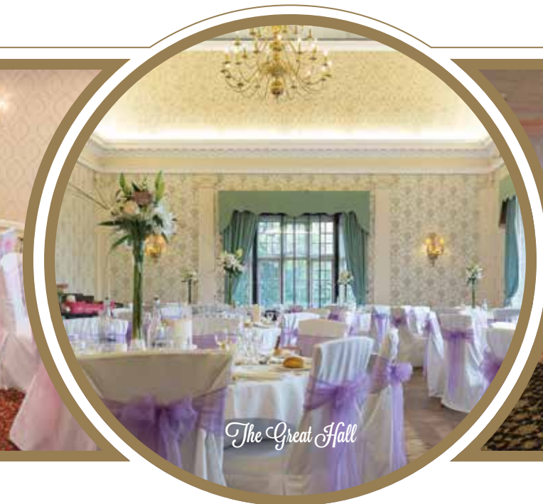
The Great Hall